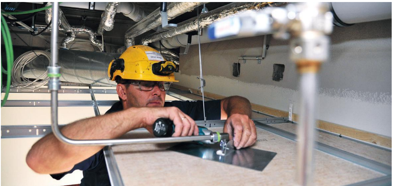
Quick and easy installation of the SEM-SAFE® high-pressure water mist nozzle.

The water mist solution saves 2 to 7 minutes for emergency response personnel compared to a sprinkler solution, where the fire fighters must first roll out their equipment before entering the building.