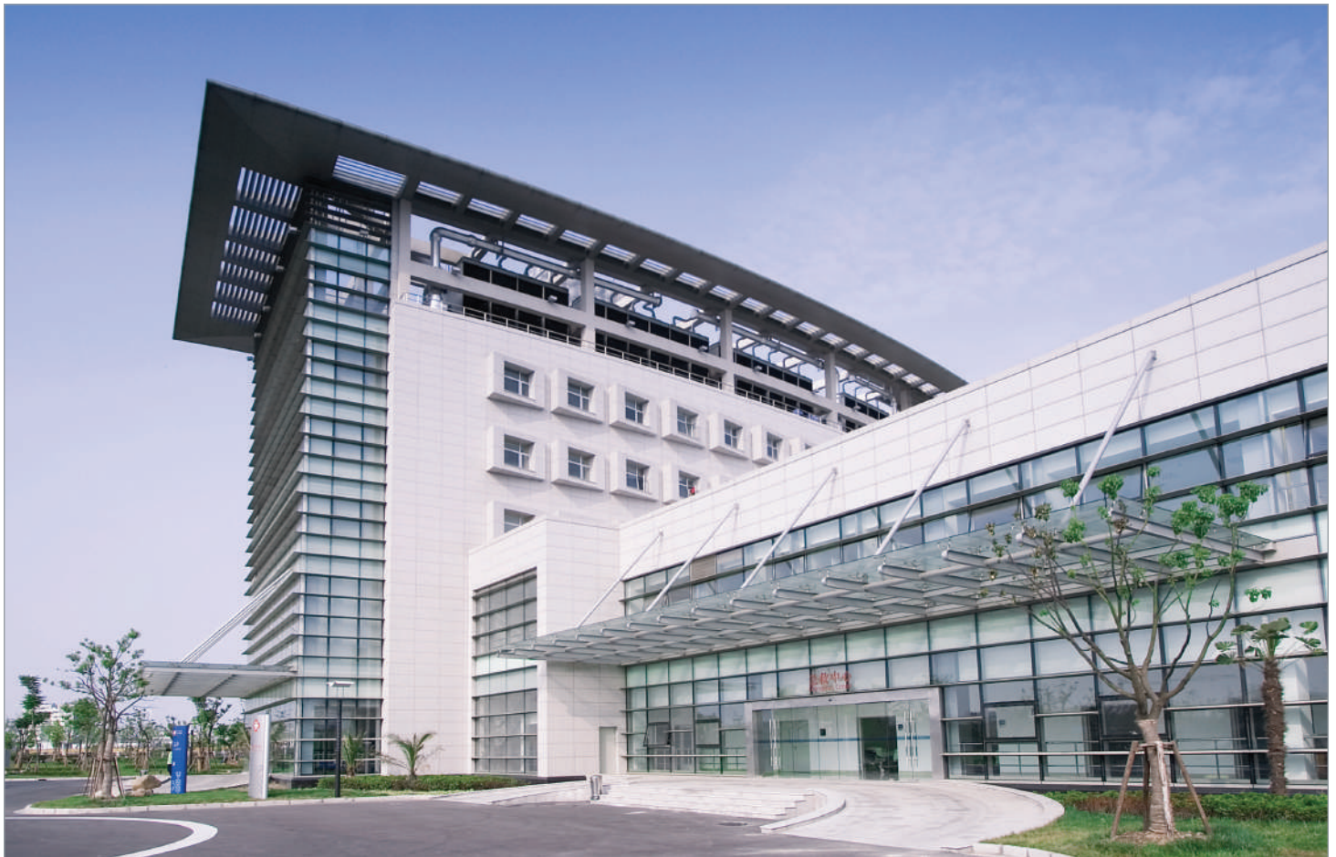
Shuguang Hospital in China, protected with SEM-SAFE® high-pressure water mist system from Danfoss.

The hospital is very satisfied with this efficient, environmentally friendly and maintenance free system.